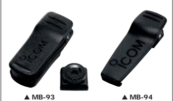
▲ MB-93 ▲ MB-94

MB-93 : Swivel type. A fast and easy way to remove the transceiver from your belt.