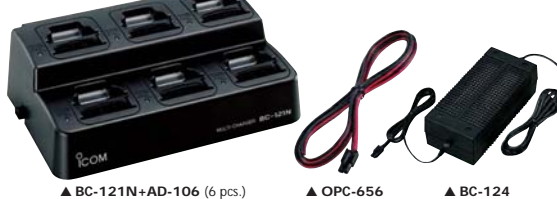
▲ BC-121N+AD-106 (6 pcs.) ▲ OPC-656 ▲ BC-124

BC-121N MULTI-CHARGER + AD-106 CHARGER ADAPTER + BC-124 AC ADAPTER