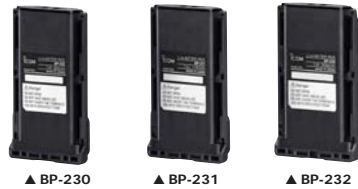
▲ BP-230 ▲ BP-231 ▲ BP-232