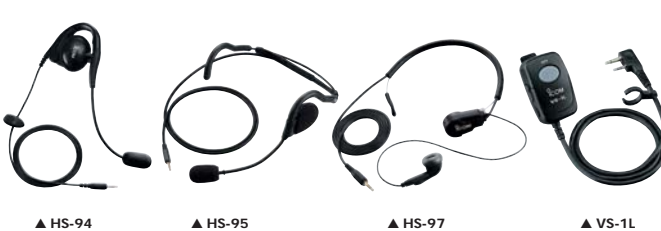
▲ HS-94 ▲ HS-95 ▲ HS-97 ▲ VS-1L

HS-94 : Earhook headset with flexible boom microphone.