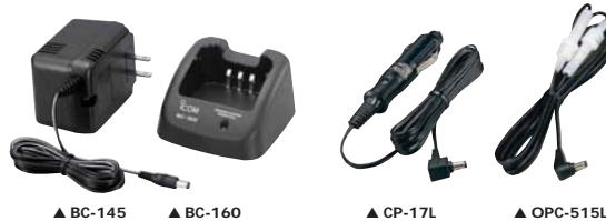
▲ BC-145 ▲ BC-160 ▲ CP-17L ▲ OPC-515L

BC-160 DESKTOP CHARGER + BC-145 AC ADAPTER Charges the BP-231 in 2 hours (approx.).